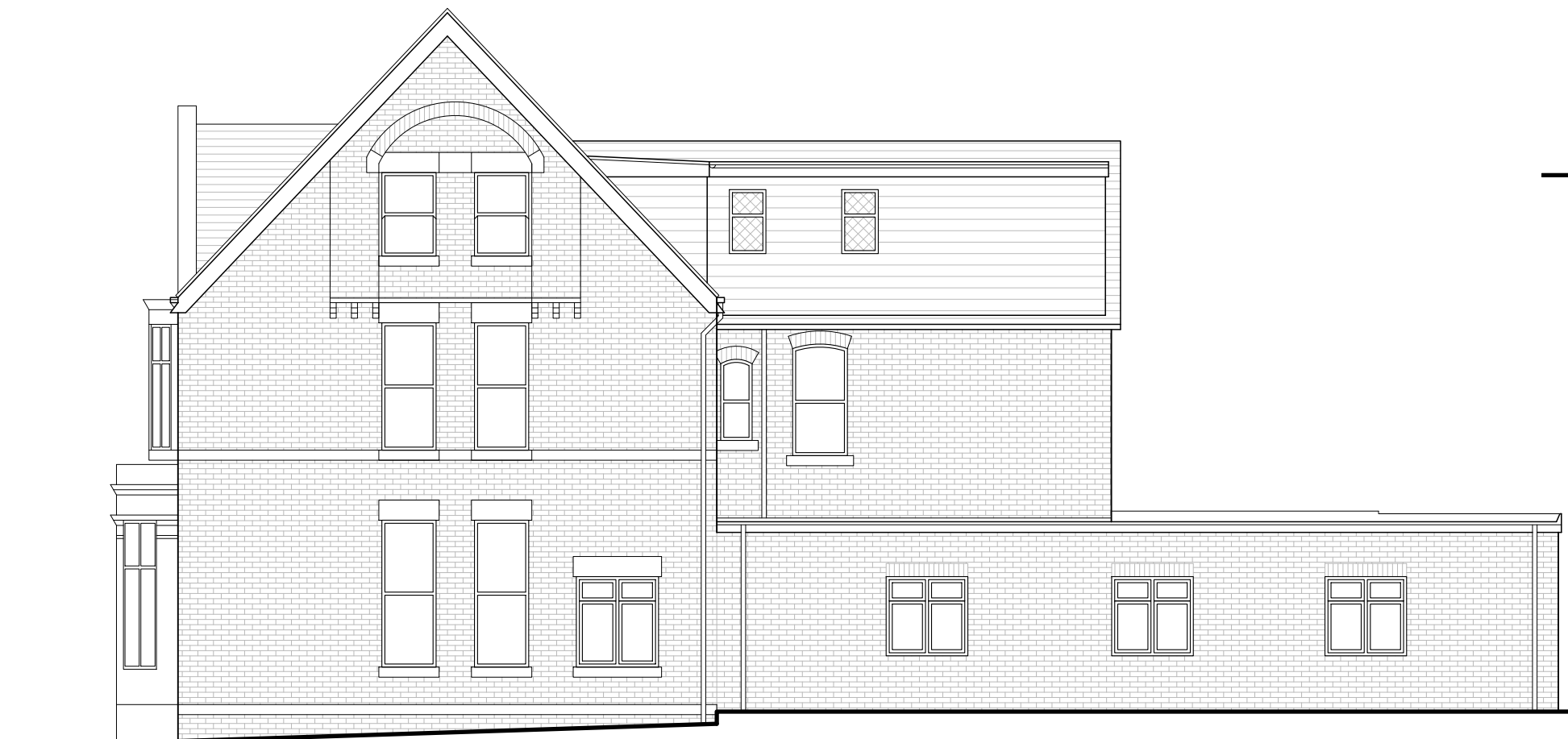
Proposed Side Elevation - 1:100