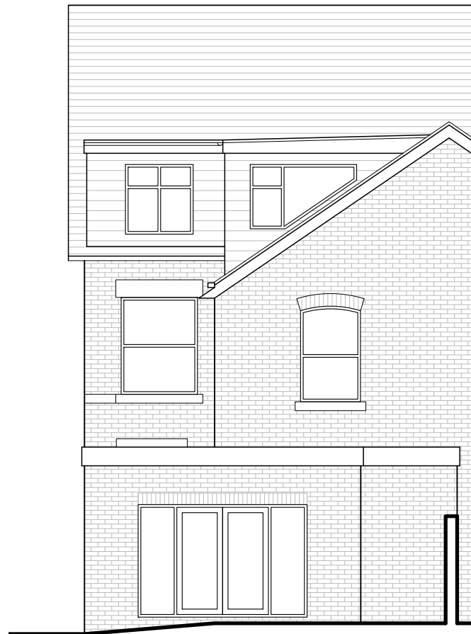
Proposed Rear Elevation - 1:100