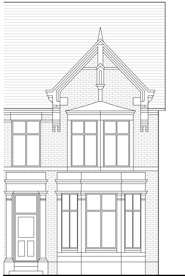
Proposed Front Elevation - 1:100